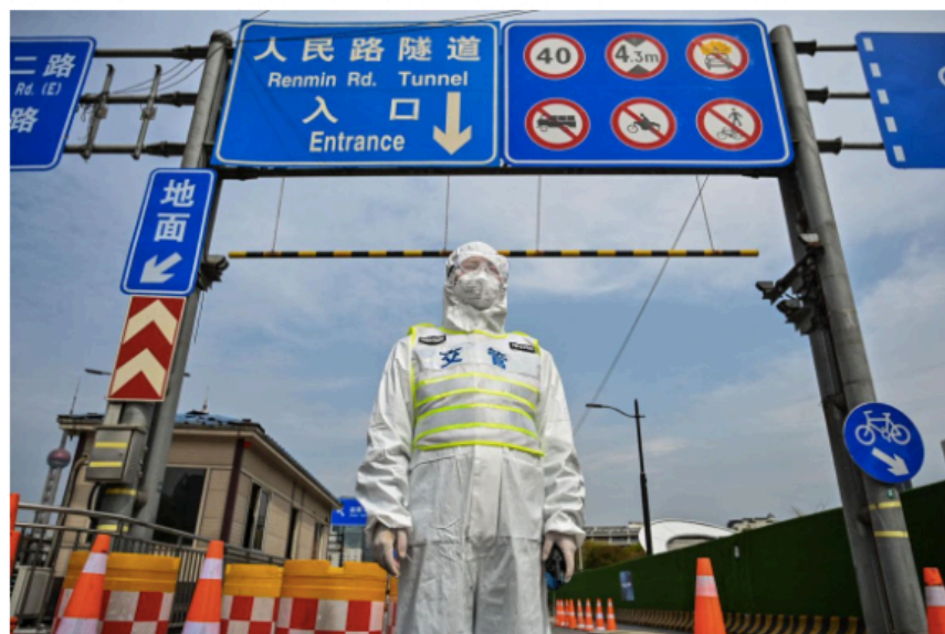
Many parts of China were still enduring lockdowns by late last year