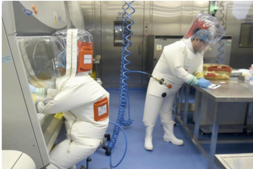
Before Covid-19 the Wuhan institute investigated whether mutant viruses they had created had the potential to spark a pandemic

The US embassy found out about the experiments in Wuhan and sent diplomats with scientific expertise to inspect the institute in January 2018, according to diplomatic cables leaked to The Washington Post. They observed “a serious shortage of appropriately trained technicians and investigators needed to safely operate this high-containment laboratory”.