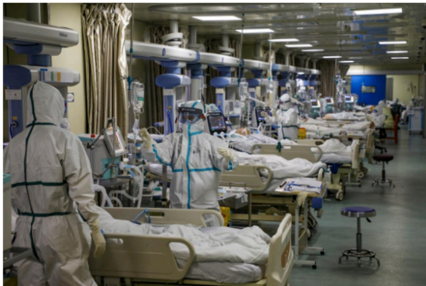
Chinese medical workers in protective suits in early February 2020

Separate analysis shows the centre of the initial outbreak of Covid-19, which has killed more than seven million people, was close to the institute’s laboratory, rather than at the city’s “wet” wildlife market as had been thought.