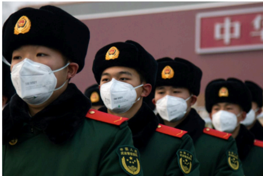
Chinese military staff were given positions of responsibility in the Wuhan institute long before Covid-19 emerged, according to a US Senate report

This explains why from the beginning of the outbreak, he says, the pandemic virus was so remarkably well adapted to infect humans.