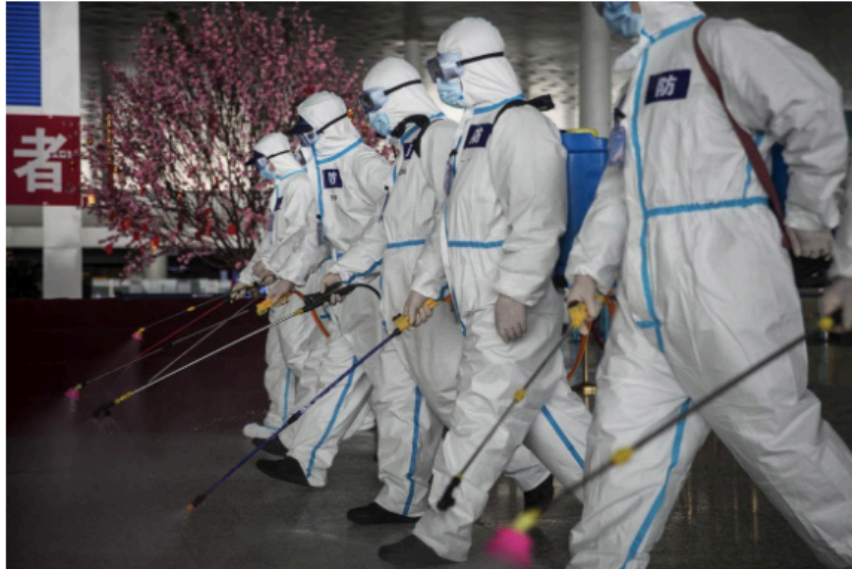
Firefighters disinfecting Wuhan airport in April 2020, after the coronavirus had gone global

says his 2018 statement about the “mild” illness was based on preliminary results — even though the experiment in which the mice died had taken place several months before he issued the statement.