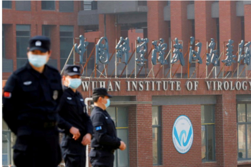
Covid-19 is widely believed to have originated at the Wuhan Institute of Virology

The facility, which had started hunting the origins of the Sars virus in 2003, attracted US government funding through a New York-based charity whose president was a British-born and educated zoologist. America's leading coronavirus scientist shared cutting-edge virus manipulation techniques.