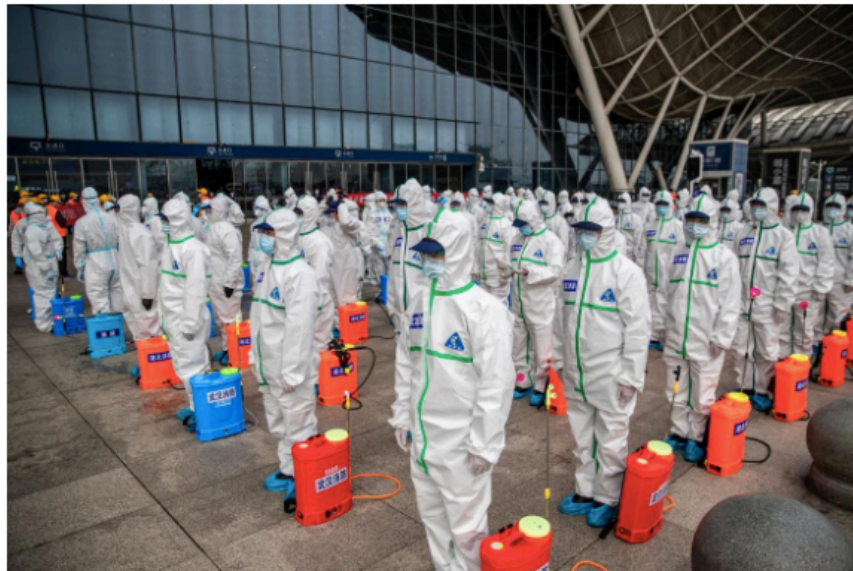
Railway workers disinfect the main station in Wuhan in March 2020

He reviewed some of the experiments and describes them as “by far the most reckless and dangerous research on coronaviruses — or indeed on any viruses — known to have been undertaken at any time in any location”.